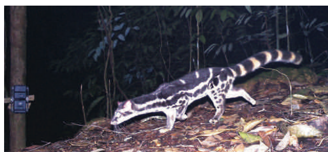
Fig. 1. Banded linsang Prionodon linsang camera-trapped in Crocker Range Park, Sabah, Malaysia, on 26 December 2011.

trapped: several species of ground-dwelling South-east Asian weasel Mustela Linnaeus, are camera-trapped only rarely, even where known by other methods to be present (Duckworth et al., 2006; Abramov et al., 2008; Ross et al., 2013; Chutipong et al., 2014). Many behavioural and microhabitat characters can affect the chance of a species being camera-trapped, in addition to its abundance. Perhaps the author with the most direct knowledge of banded linsang in the wild, Lim (1973), considered it frequently to inhabit secondary and edge tangles. These are not typical camera-trapping areas. Nothing is known about its home-range sizes or population densities.