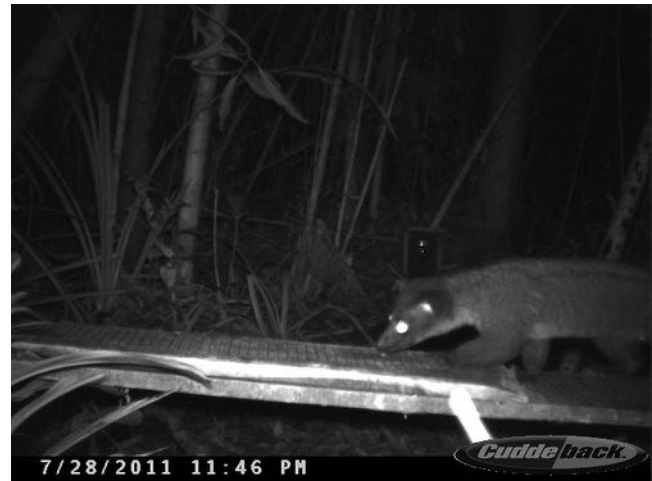
Fig. 1. small-toothed palm civet Arctogalidia trivirgata , Sabangau Peat-swamp Forest, Central Kalimantan, 28 July 2011 (Photograph by: Susan M Cheyne/OuTrop).

The genus has never been studied in the field anywhere in its range. It is known only from records during general collecting expeditions and surveys, limited observation of captive animals, and some study of museum material (Duckworth & Nettelbeck, 2008 and references therein). The taxonomic diversity within the genus suggests it is particularly risky to pool ecological and behavioural information from