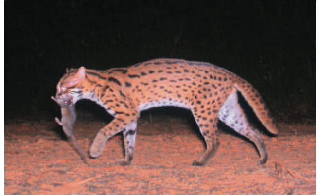
Fig. 1. Leopard cat Prionailurus bengalensis camera-trapped in Tangkulap Forest Reserve, Sabah, Malaysian Borneo, on 27 February 2009.