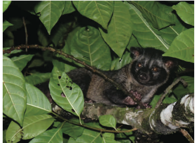
Fig. 1. A common palm civet Paradoxurus hermaphroditus photographed in Tabin Wildlife Reserve, Sabah, Malaysia, on 20 November 2009.

Species occurrence records. In total, 417 occurrence records were obtained fairly evenly from across Borneo (Fig. 2) with the exception of the central, mountainous regions.