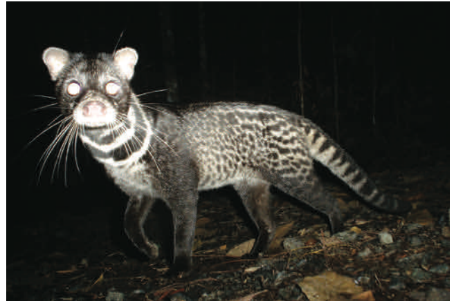
Fig. 1. A Malay civet Viverra zibetha camera-trapped in Ulu Segama Forest Reserve, Sabah, Malaysia, on 16 July 2007.

Because of a wide geographical range, apparent viability in modified habitats and a presumed large population size across its range, it is listed by The IUCN Red List of Threatened Species as globally Least Concern (Azlan et al., 2008). However, the extent to which the Malay civet can tolerate habitat alteration and its level of forest dependency remains unclear. While not specifically targeted by hunters