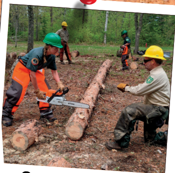
PARTNER WITH PROFESSIONALS