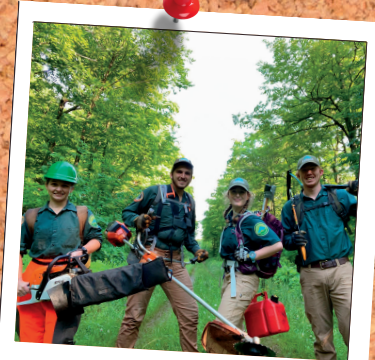
WORK AS A TEAM