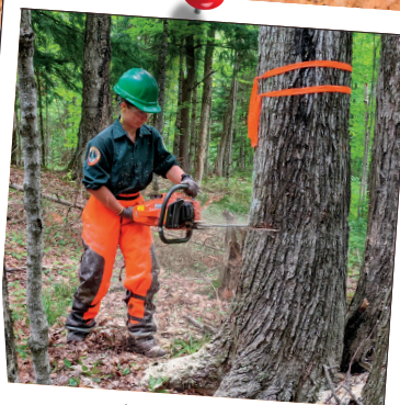
OTTAWA FORESTRY CREW