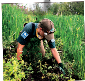
ACT ON CLIMATE CHANGE