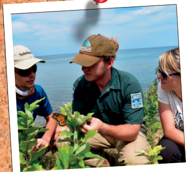
RESTORE NATIVE HABITAT