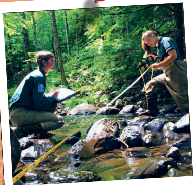
STREAM INVENTORY DRONE TEAM