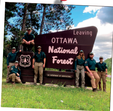
USFS TECHNICIANS HIAWATHA + OTTAWA