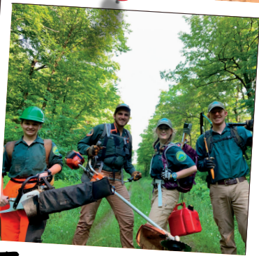
TRAILS + WILDFIRE PREVENTION CREW