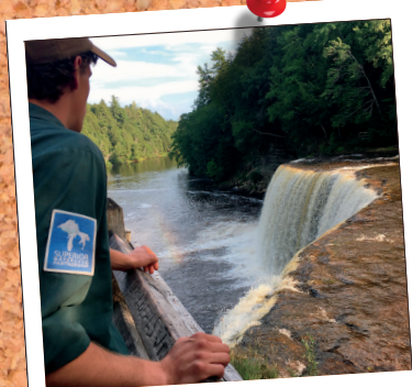
EXPLORE THE UPPER PENINSULA