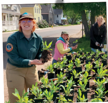
GREAT LAKES TRIBAL CONSERVATION CORPS