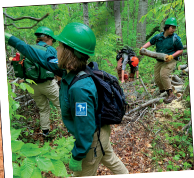
GREAT LAKES CLIMATE CORPS