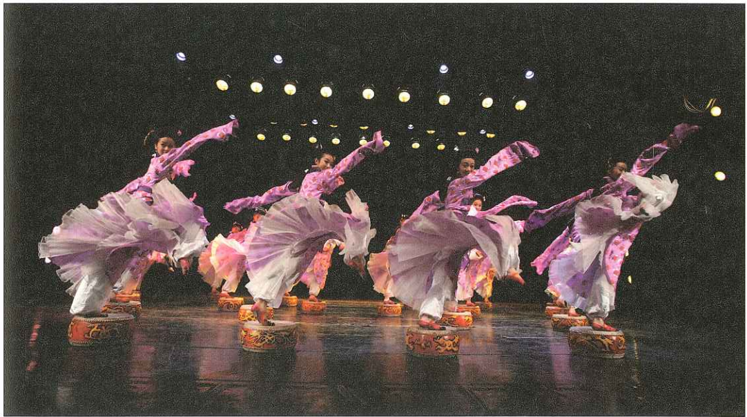
PLATE 7. Dancer of the Tongque Stage (Tongque ji) a full-length dance drama by Sun Ying in the Han-Tang Zhongguo gudianwu style.