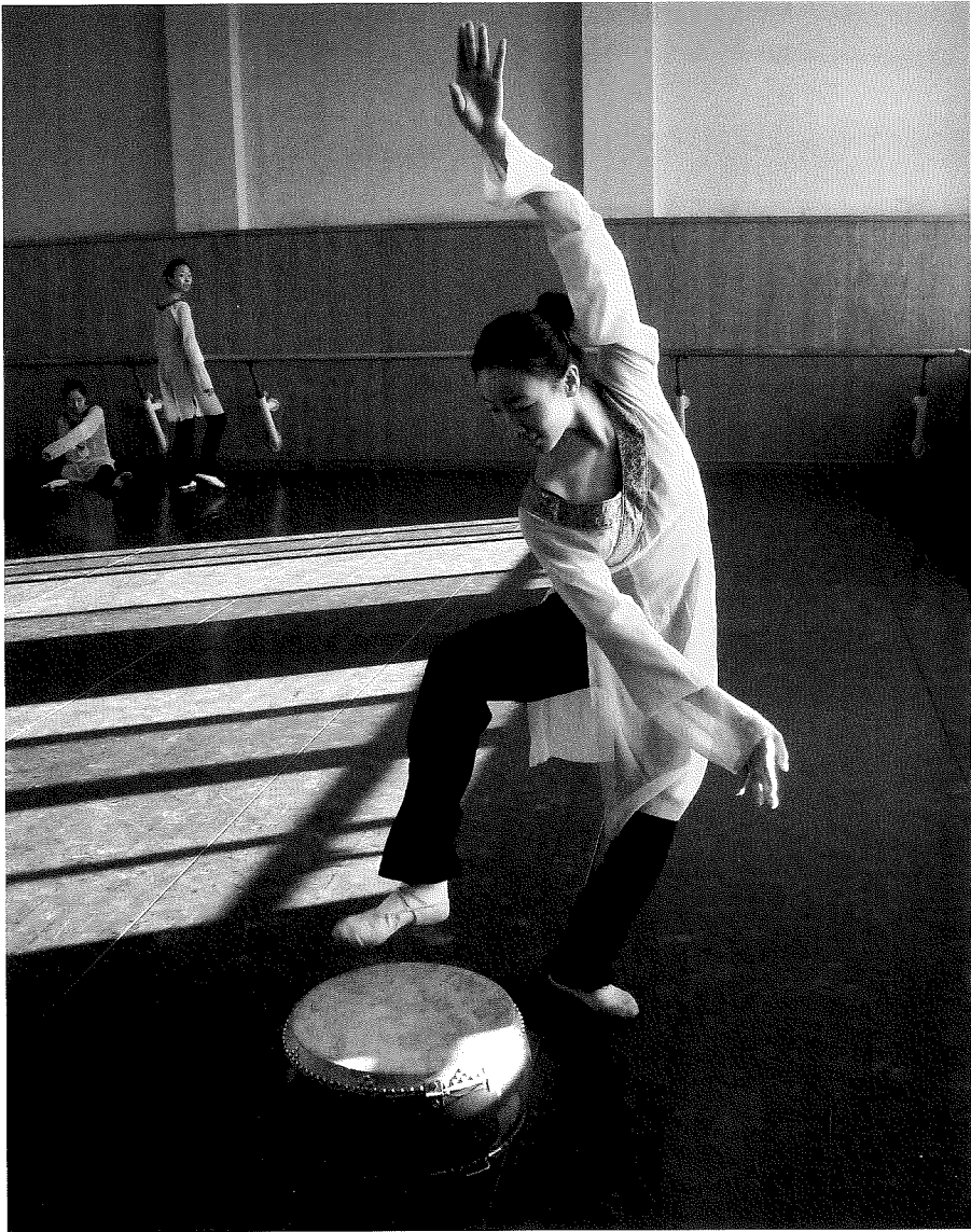
FIGURE 4. Student practicing a Han-Tang foot drum technique routine at the Beijing Dance Academy in Beijing in 2009.