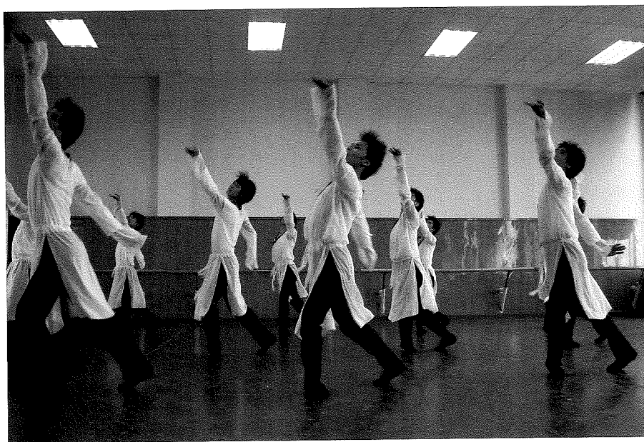
FIGURE 1. Students in a Han-Tang technique class at the Beijing Dance Academy, 2008.

Sun is part of what dancers in China call "the old generation" (Figure 2). 2 Born in 1929 in northeast China, Sun was twenty when the