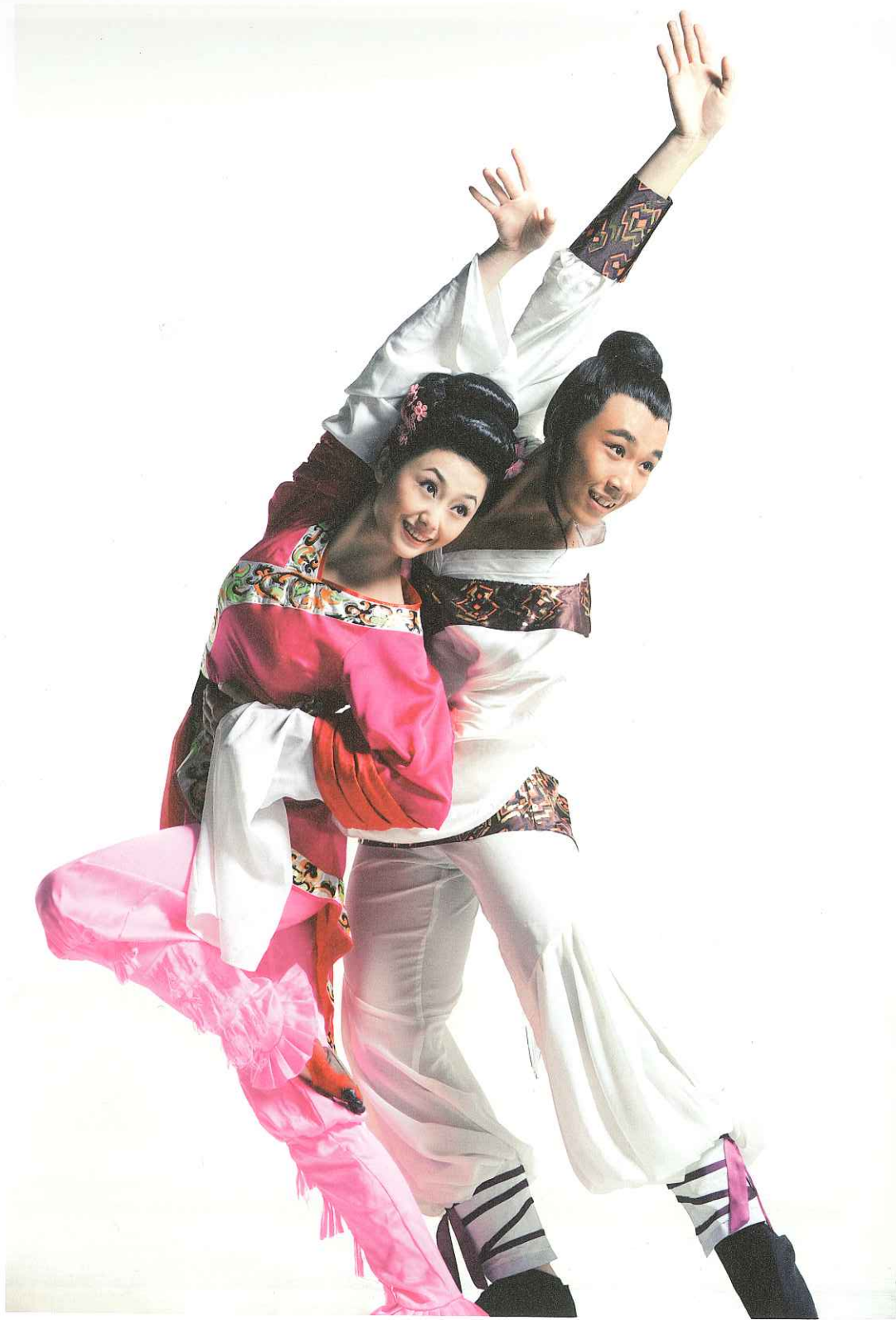
PLATE 8. Dancer of the Tongque Stage (Tongque ji) a full-length dance drama by Sun Ying in the Han-Tang Zhongguo gudianwu style.