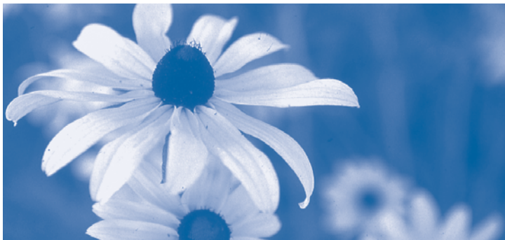
Michigan native, black eyed Susan (Rudbeckia).