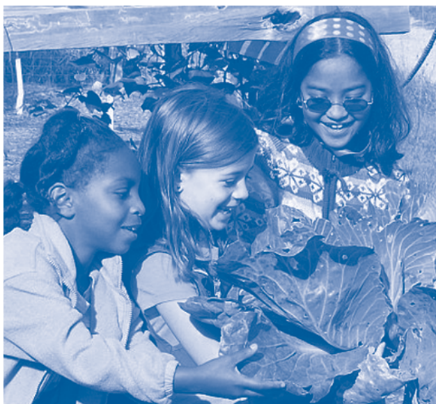
Brownies learning how cauliflower grows.

When the program needs are child-oriented, it can bring out one's own 'inner child.' How well I remember my grandmothers' gardens – furry plants as lamb's ears for petting or achilleas for the finely dissected foliage that is so wondrous when caressed. Visual textures, as the patterns in two-ranked leaves of iris or the elfin depth in the narrow tubes of morning glories and salvias, add their own excitement. Do we need perennials with bright flowers that will attract butterflies from June to July? That requires thinking and cross-checking through 'generalist' flowers as echinaceas and eupatoriums that may be later in the season to 'specialist' flowers as pale Ipomopsis or selected phlox that will be a bit earlier. Plants must be able to grow in the light, soil, and other conditions offered by the garden. Such cases result in a team discussion about which criteria are more important than others. From the prioritized criteria, I propose back different sets of plants that I believe will grow in that site without exceptional care. Of course, the student and staff designers need to make their design decisions as designers – my role is to see that their decisions are well-informed. So now it's your turn – come on out and experience the Gaffield Children's Garden – and think beyond the surface. Let me know your thoughts. If you don't find me on your visit day, just drop me an email at michener@umich.edu 🌱