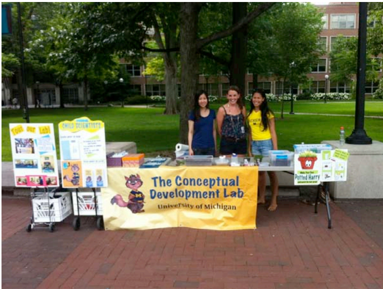
Ann Arbor Book Festival

We had a great time this year attending local events and sharing our research with families! You may have seen us with Potted Harry crafts at the Farmers Market, the Ann Arbor Book Festival, or the Ann Arbor Summer Festival. Recently, we participated in the Ann Arbor Art Fair! At the Art Fair, we made bubble wands with kids while discussing our studies with families. We'd like to thank all those who came out to see us! Follow us on Twitter or like us on Facebook to learn about future events!