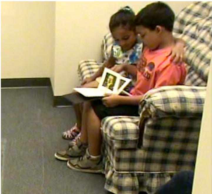
A brother and sister looking through a picture book ("Learning from Siblings").

Learning to give gifts, borrow things, and make purchases are important life skills that children must master. In a variety of studies, we explore how children develop these skills by giving them objects and asking children to give objects to other people, and then testing children's memory for which object belongs to which person. This task can be tricky, but children are surprisingly good at it. Furthermore, children's memory for owner-property pairs is better than their memory for simple labels. These studies seek to understand how children think about ownership in order to gain insight into the more complex social and economic environment that older children and adults experience every day.