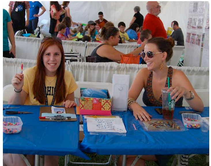
Ann Arbor Art Fair