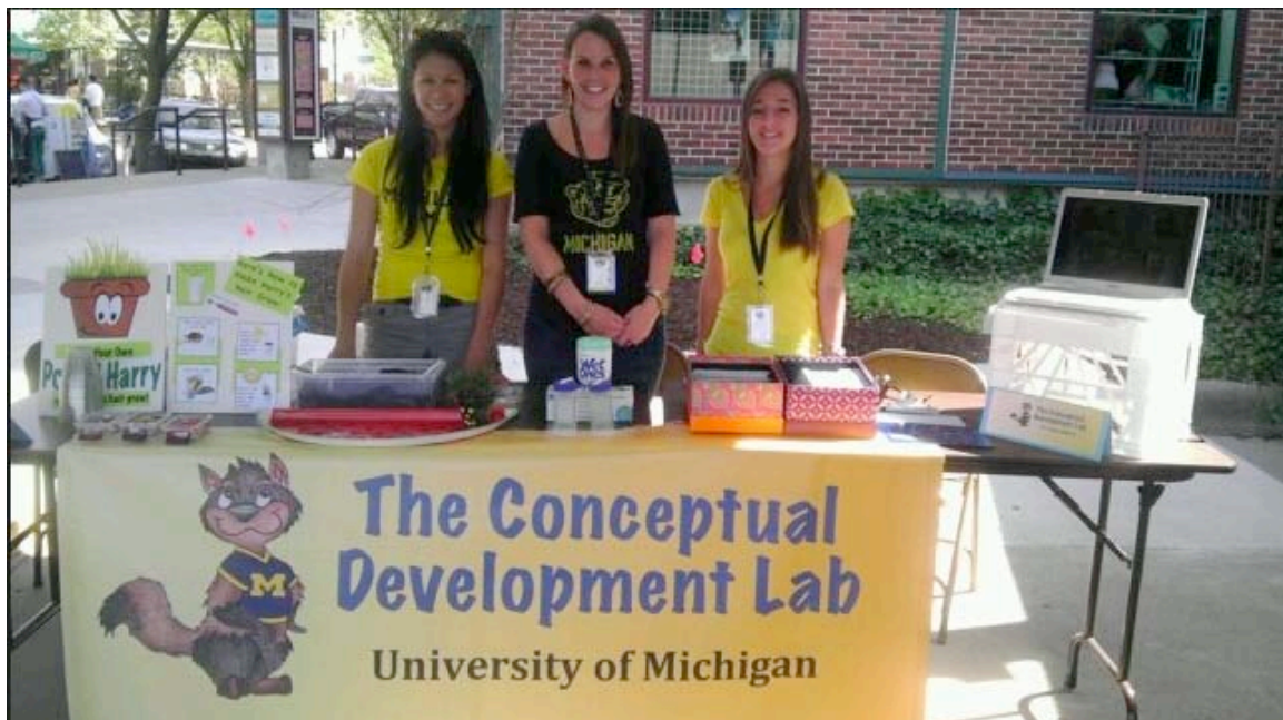
Ann Arbor Farmers Market