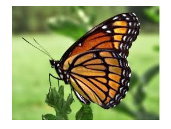
Finally becomes a butterfly