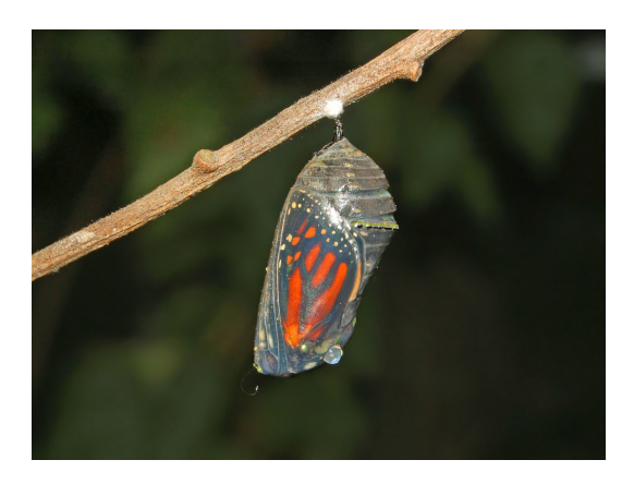
Eats then become chrysalis