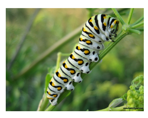
Grow up to caterpillar