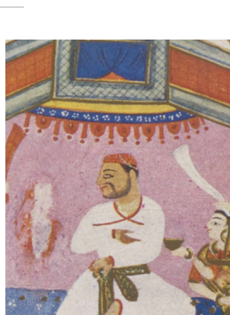
Unidentified artist, Humayun and Husain Shah with attendants, Tarif-i Husain Shah (Praise of Husain Shah) , Ahmednagar ca. 1565-69, opaque watercolour and gold on paper, f. 32r, Bharat Itihas Sanshodak Mandal, Pune.