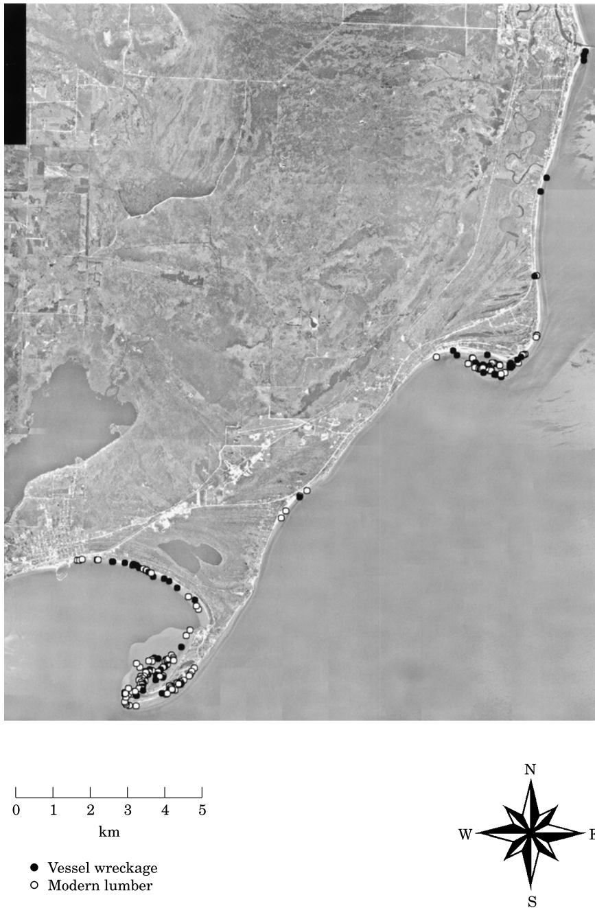
Figure 4. Distribution of vessel debris and modern timber along the Au Sable shore area of western Lake Huron, recorded during survey, May 2001. Background satellite coverage is photo-mosaic produced from USGS digital ortho-quads (DOQ), 1993.

pattern of occurrence. Regardless of age or source, debris is not distributed evenly over the region, but is strongly concentrated in major debris fields in the vicinity of the two recurved spits. Since free-floating wreckage from a broken vessel, like any other debris, tends to accumulate in such areas, the spatial association of wreckage