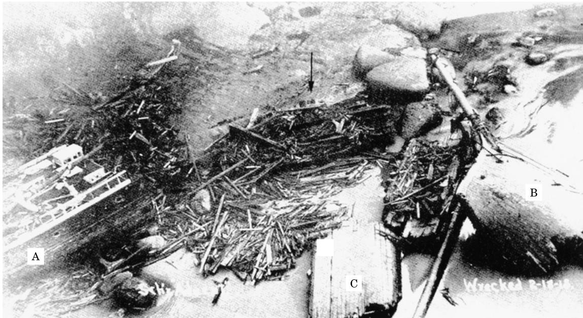
Figure 2. The wrecked schooner Advent , Coos Bay, Oregon, 1913. Letters A, B, and C mark the aft, fore, and side planking of the vessel. The arrow marks the broken ends of the lower frames.

processes that have been identified during the course of the Au Sable Shores research.