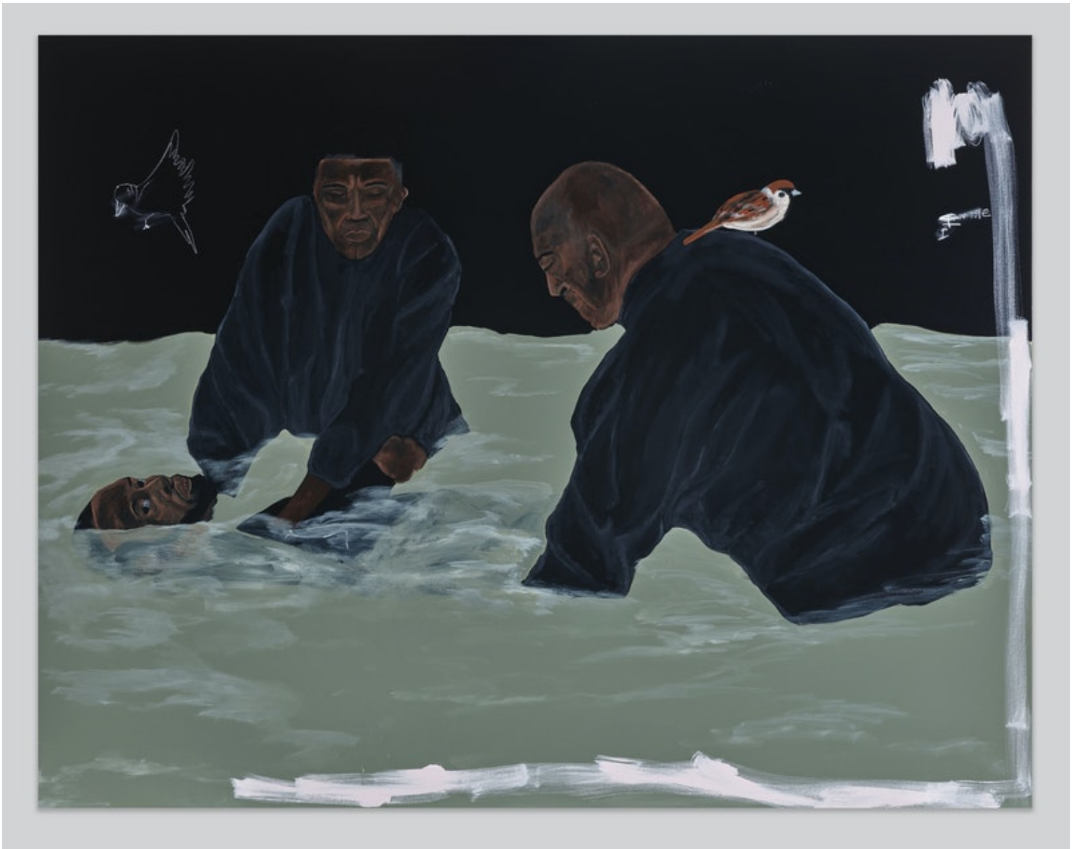
Jammie Holmes, Blame The Man , 2021. Acrylic and oil pastels on canvas 70 1/8 x 90 inches. Courtesy Library Street Collective, Detroit.