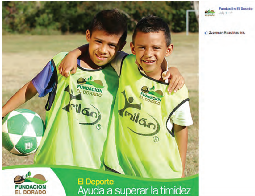
El Dorado Foundation: 'Sports, overcome shyness'