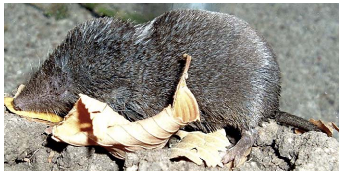
Fig. 1. —An adult male Blarina hylophaga from Kansas: Ellis Co.; 9¼ mi. N, ¾ mi. W Hays, T12S, R19W, E center sec. 14; 39.01055°N, 99.39038°W.

NOMENCLATURE NOTES. Until recently, B. hylophaga was listed as a subspecies of B. brevicauda and subsequently B. carolinensis (Blair 1939; Elliot 1899, 1905; Genoways and Choate 1972; George et al. 1981; Schmidly and Brown 1979). Therefore, an extensive literature search was conducted to find current citations of the name B. hylophaga and the