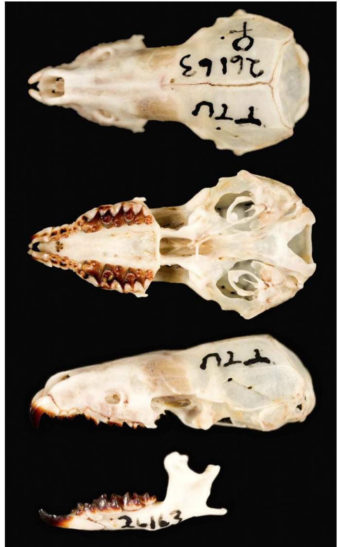
Fig. 2.—Dorsal, ventral, and lateral views of skull and lateral view of mandible of an adult female Blarina hylophaga (TTU [Natural Science Research Laboratory, Museum of Texas Tech University] 26163) from Kansas: Ellis Co.; 15 mi. N, 7 mi. W Hays, T11S, R19W, SW \frac{1}{4} sec. 16. Greatest length of skull is 22.75 mm.

The distinction in geographic ranges offers some assurance as to differentiating the species (Benedict 1999a, 1999b; Genoways and Choate 1972; George et al. 1981, 1982; Moncrief et al. 1982). The geographic range of B. hylophaga generally lies south and west of B. brevicauda and B. carolinensis (Fig. 3), respectively (Jones et al. 1984; Schmidly 1983). However, a parapatric contact zone occurs in areas of southwestern Iowa (Benedict 1999a, 1999b; Bowles 1975; Thompson 2008), northeastern Kansas (Thompson 2008), southern Nebraska (Benedict 1999a,