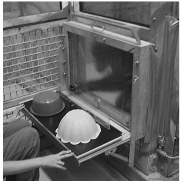
Figure 1. Apparatus. Chimpanzees and bonobos chose between fixed and risky rewards hidden under bowls.

In choices between a fixed and a risky reward option (using choice trials from all sessions), chimpanzees were risk seeking (mean \pm s.e. proportion choosing fixed option, 0.36 \pm 0.04 ), significantly preferring the risky reward ( t(4) = -3.48 , p = 0.025 one sample t -test, all reported comparisons are two-tailed). In contrast, bonobos were risk averse ( 0.72 \pm 0.03 ), preferring the fixed reward to the risky ( t(4) = 6.40 , p = 0.003 ).