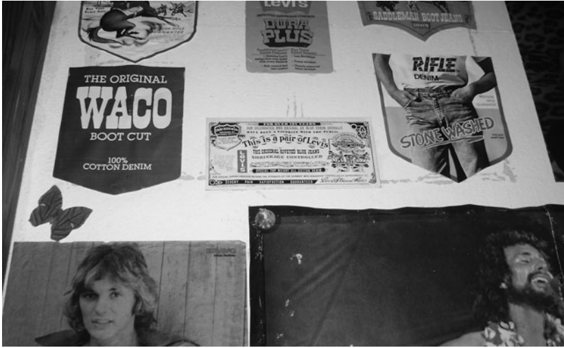
IMAGE 2 The wall décor from a teenage girl's room in the late 1970s, including advertisements and labels from Western jeans.

offer as fundamentally opposed to socialist citizens, rather than as the wealth produced by and for collective labor. Retail staff, as the human face of official state consumption, exacerbated rather than mitigated the alienation arising from the impersonal exchange of money for object. As we shall see below, the physical properties of state goods often contributed to this alienation by the ways they resisted appropriation after acquisition.