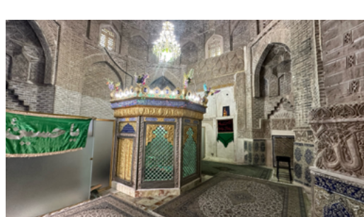
Interior of the tomb of Emamzadeh Yahya, Varamin.

The Emamzadeh Yahya at Varamin is simultaneously the burial place of a ninth-century saint (Yahya b. Ali), a destination for ziyarat (pious visitation), a neighborhood community center and cemetery, an architectural monument of Iran's Ilkhanid period (1256–1353), a cultural heritage site that has experienced destruction and renewal, and an 'object' on display in over forty museums worldwide. This online exhibition offers an alternative museological space for exploring the shrine's many looks, functions, resonances, users, and stories over the last seven hundred years. Directed by curator Keelan Overton since 2021, this grassroots and independent project involves an international cast of contributors and is distinguished by its interdisciplinarity and accessibility. Khamseen agreed to host the exhibition and provided the project with funding from the University of Michigan's History of Art Department to support its website design, translations (English and Persian), and online production. The exhibition will be the first feature in Khamseen's new Projects tab and is expected to launch in late 2024. Here is the Coming Soon page.