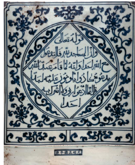
Porcelain tile, Jingdezhen, China, Ming dynasty, 1506-1521 CE, unknown artist. The Arabic inscriptions provide Qur'anic verses praising monotheism and mosques (72:18-20). inv. no. PDF.B.687.

Khamseen also received a three-year grant for a collaboration with the Dunhuang Foundation . The grant enables us to create a collection of talks and pedagogical materials dedicated to Sino-Islamic arts, with some of the materials to be closed captioned and dubbed into Chinese. The videos will explore materials from the maritime Silk Road to the Southeast Asian island of Sumatra, focusing on the fascinating objects that emerged, such as Chinese blue-and-white porcelains with Arabic, Persian, and Ottoman Turkish inscriptions and Qur'an manuscripts calligraphed in Sini (Chinese-style Arabic) script. Please stay tuned as our project unfolds!