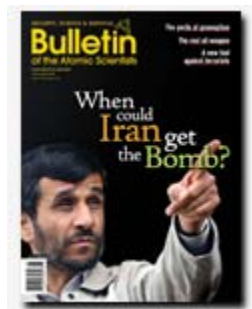
Table of Contents Subscribe Online Newsstand Locator