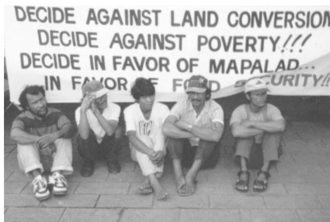
Balay Mindanaw Foundation