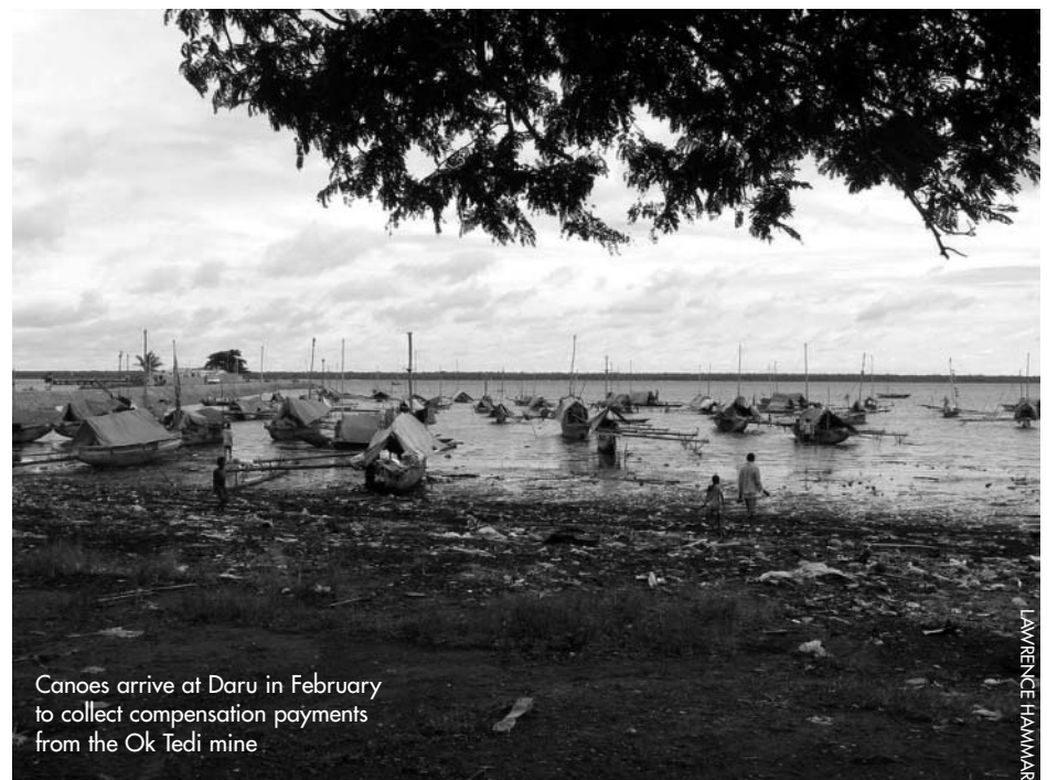
Canoes arrive at Daru in February to collect compensation payments from the Ok Tedi mine