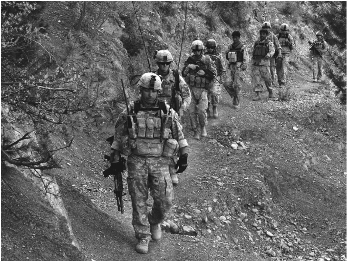
U.S. Soldiers and Afghan border policemen walk along a mountain trail during a patrol in the Pakhtiya province of Afghanistan, 13 October 2009.